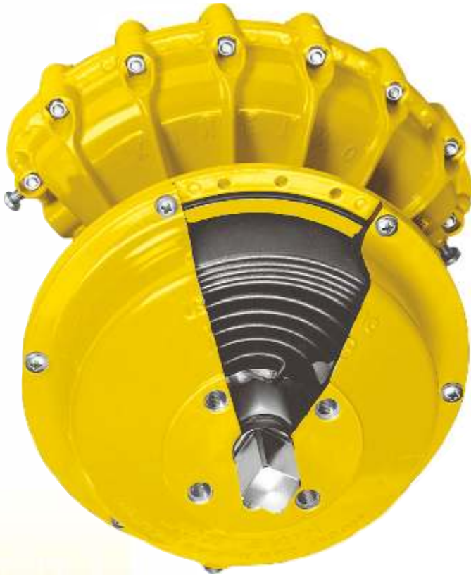
Spring housing cut away